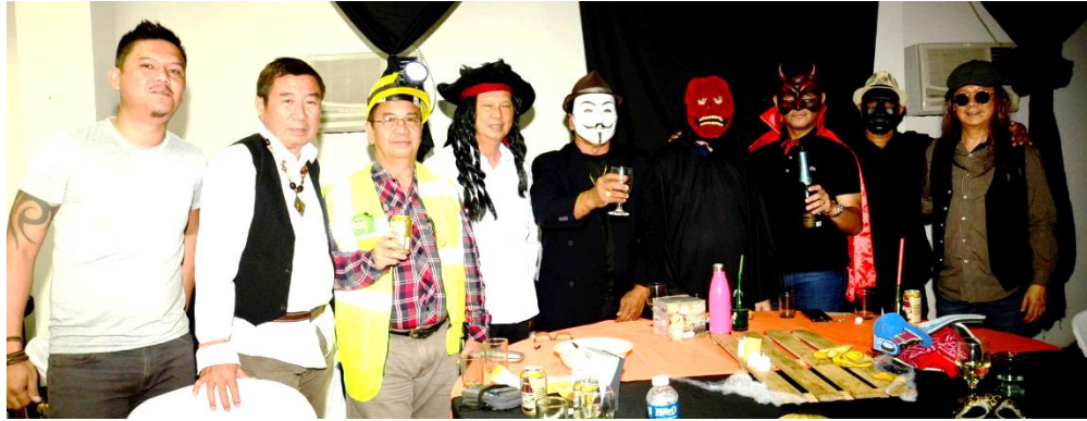
Halloween Fellowship Oct. 25, 2019 at My Hotel