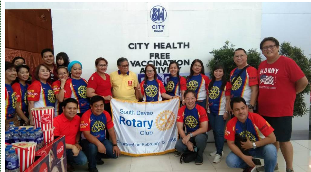
Free Polio vaccine with DOH at SM Ecoland. Oct. 19, 2019.