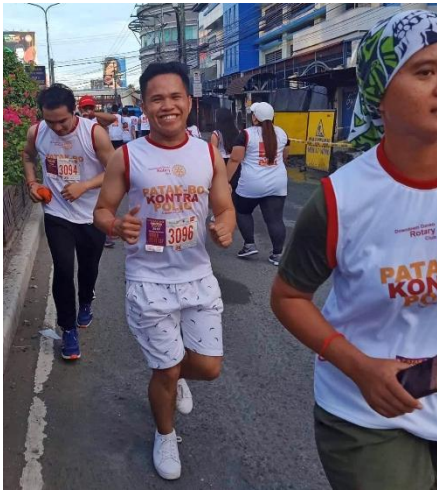
PATAK-BO KONTRA POLIO 2019. A fundraising fun run activity to END POLIO participated by Rotaract Club of South Davao Community Based & USEP Chapter hosted by RC Downtown Davao. Oct. 27, 2019